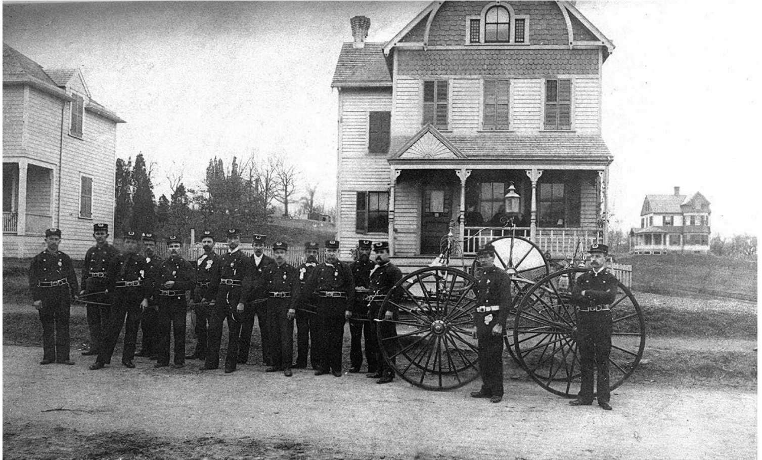
Nutley Fire Department, organized 1894