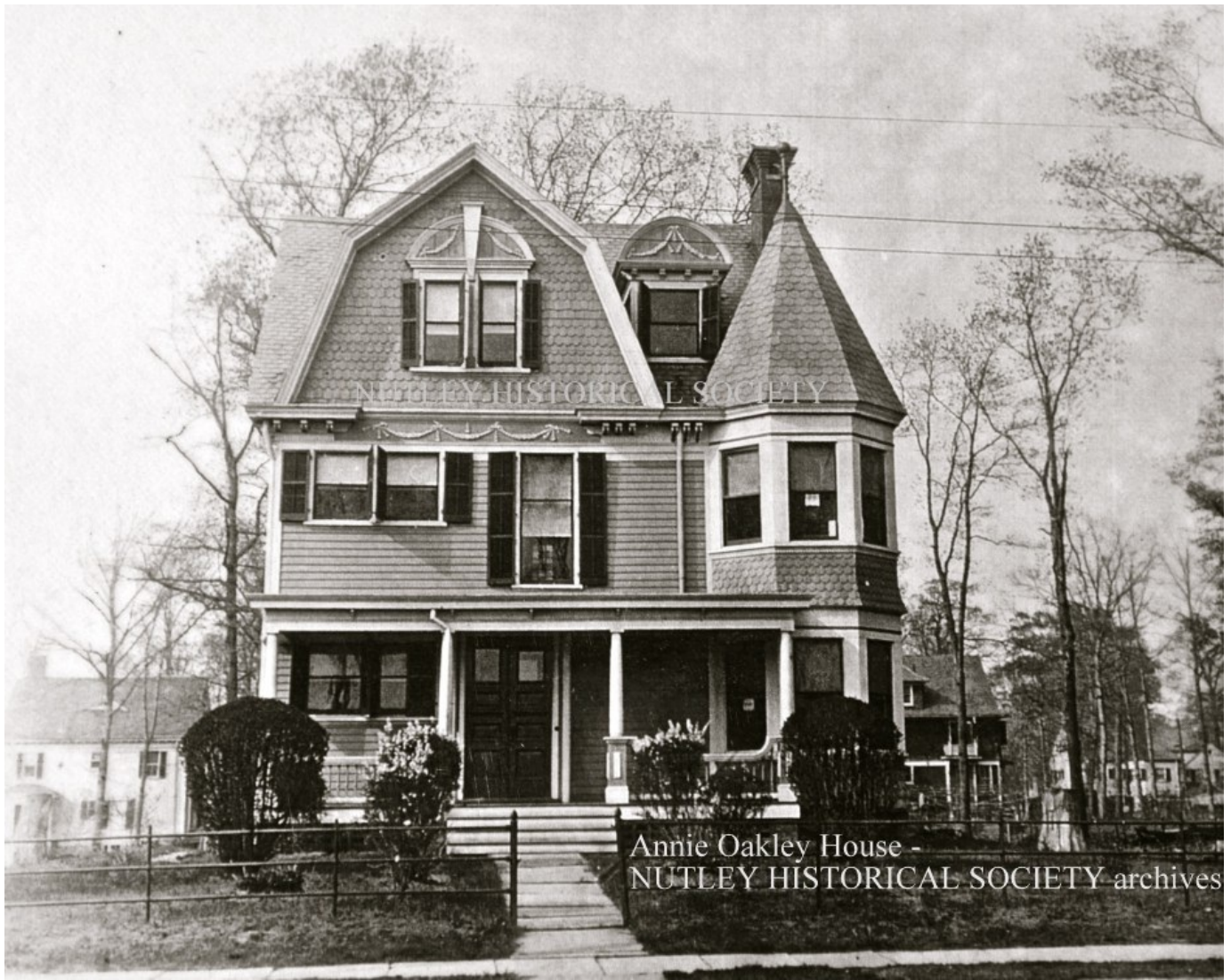
Annie Oakley's Home on Grant Avenue