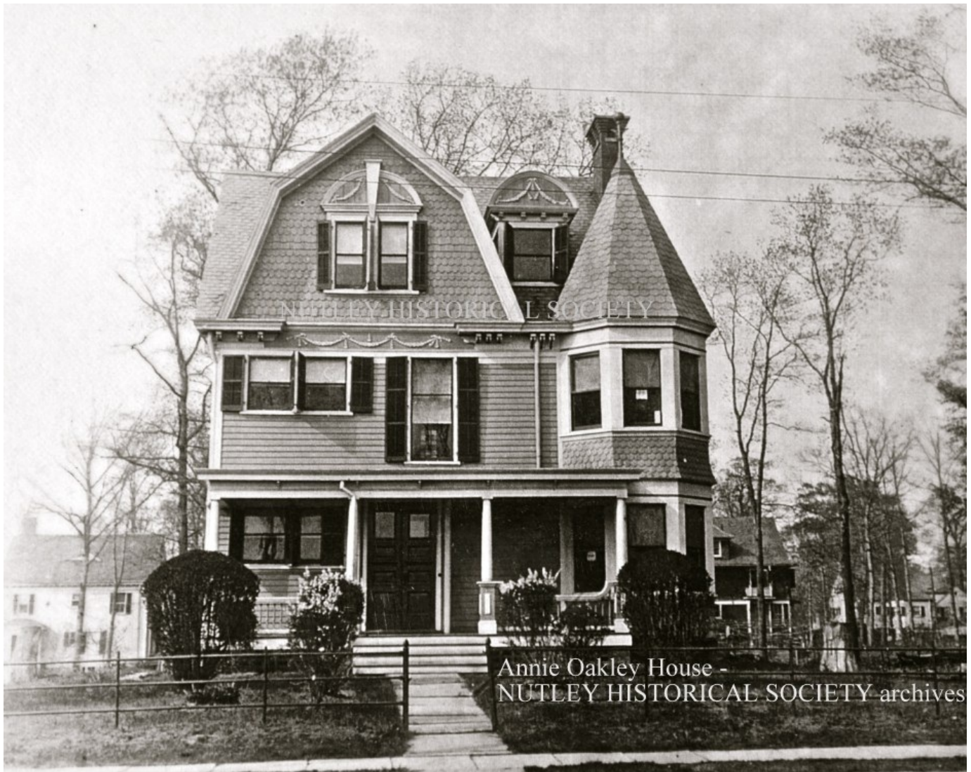
Annie Oakley's Home on Grant Avenue